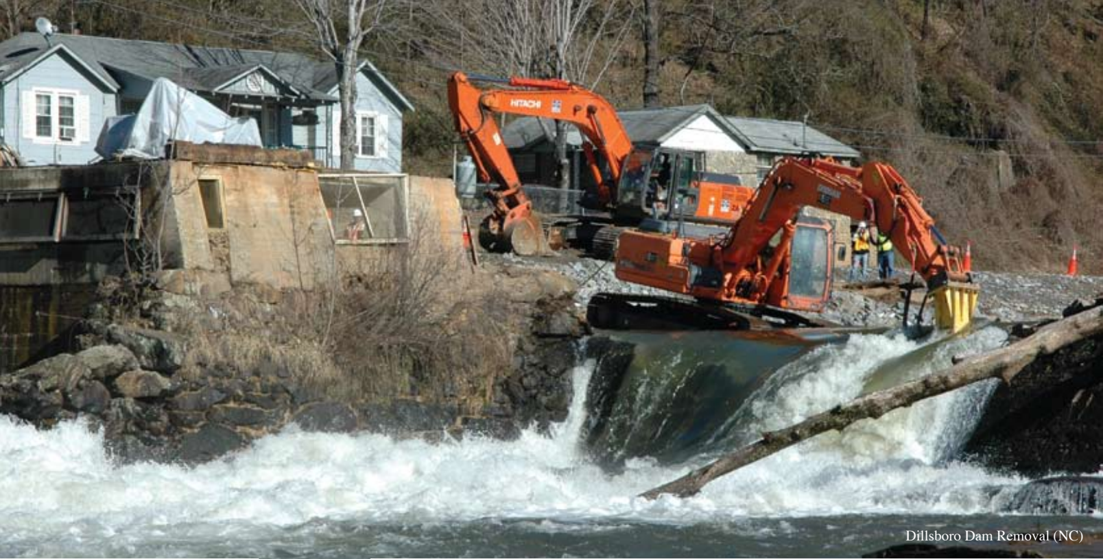
Dillsboro Dam Removal (NC)