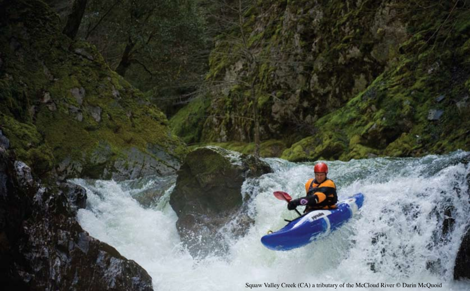
Squaw Valley Creek (CA) a tributary of the McCloud River