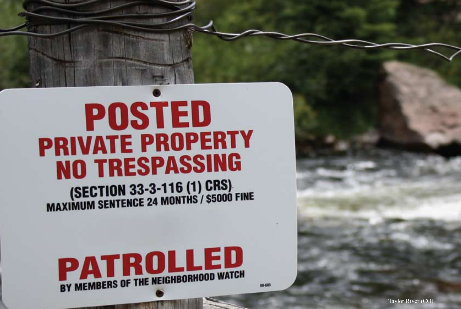
Taylor River (CO)