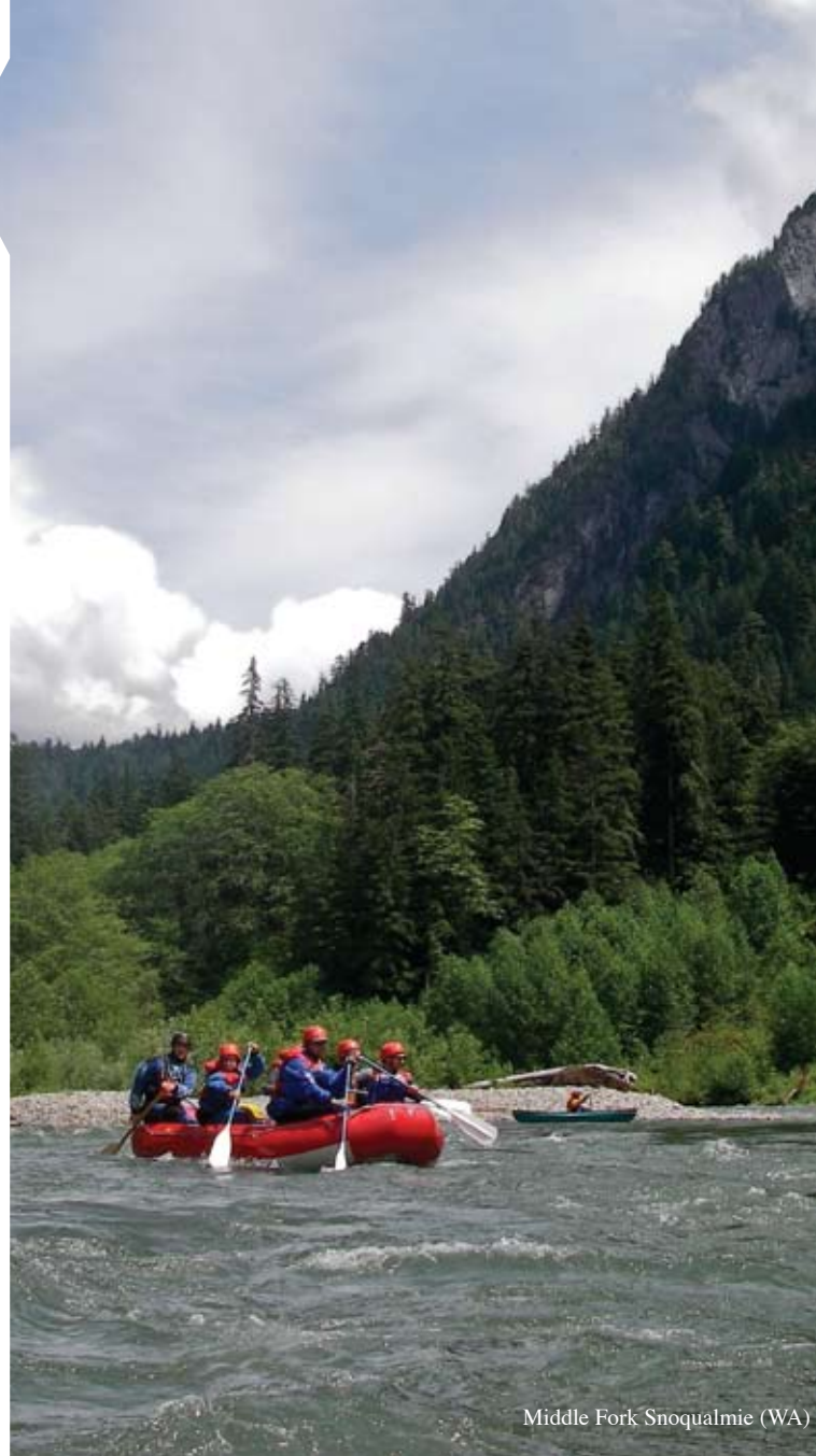
Middle Fork Snoqualmie (WA)

Some of the most important conservation gains for rivers we love included conservation of the Owyhee Canyonlands. Out in the deserts of Southeastern Idaho are some of the best multi-day canyon rivers on the continent. The Bruneau, Jarbidge, Owyhee, and their tributaries offer a lifetime of exploration on foot and by boat. This spectacular and remote area of huge basalt slot canyons, sage brush, and golden eagles is finally receiving the attention it deserves. The Owyhee Public Land Management Act would designate 517,000 acres as Wilderness and over 316 miles of rivers as Wild and Scenic. Out in Wyoming, Jackson Hole is famous for its skyline. While the Tetons certainly deserve the reputation, the rivers and streams that run through the area are equally impressive. The Snake Rivers Headwaters Act will designate many of the Snake's headwaters in and around Jackson Hole as Wild