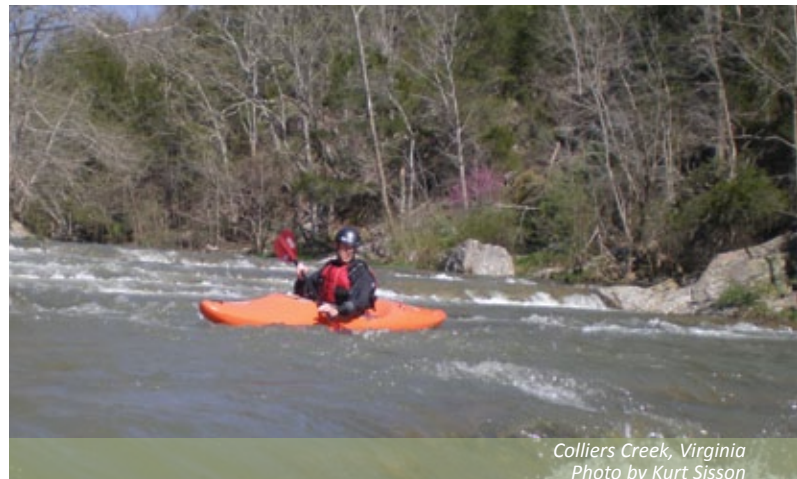
Colliers Creek, Virginia