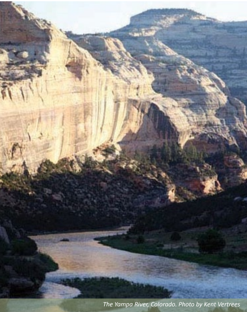
The Yampa River, Colorado.