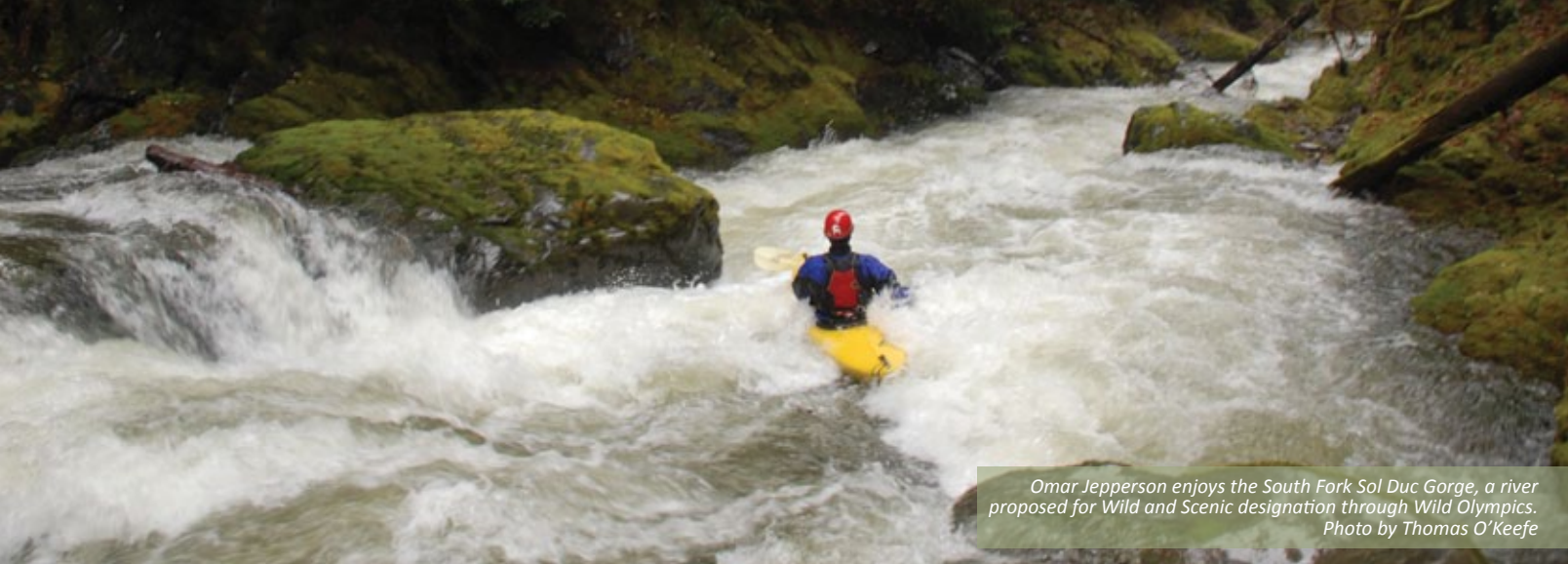
Omar Jepperson enjoys the South Fork Sol Duc Gorge, a river proposed for Wild and Scenic designation through Wild Olympics.

We measure success in cubic feet per second — the amount of water flowing freely down a river. If paddlers are floating on that water, celebrating the river and its environment, than we are doubly successful. This was the case when paddlers first floated through the Condit Dam site, and paddled the first scheduled releases on the Upper Nantahala and Bear rivers in 2012. It is also the case in Colorado, Washington, Montana, and across the country where we worked towards permanent protection for hundreds of miles of our nation’s wildest rivers. These projects exemplify our work: because of our involvement you can go to a river and see a river — not a reservoir, not a dry riverbed, but a vibrant flowing river. The photos in this report give you a glimpse into some of our major milestones from 2012. We hope they are as inspiring to you as they are to us.