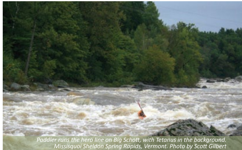
Paddler runs the hero line on Big Schott, with Tetanus in the background. Missisquoi Sheldon Spring Rapids, Vermont.

American Whitewater worked with a diverse coalition of paddlers and sportsmen throughout 2012 to seek clarity and improvements to stream access laws in Virginia. Legislation was introduced to that end, and while it failed to pass, we believe the idea of keeping people connected to rivers will gain favor in the next legislative session.