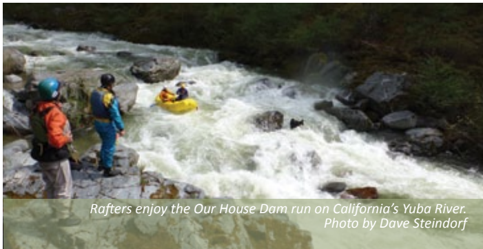
Rafters enjoy the Our House Dam run on California’s Yuba River.

We measure success in cubic feet per second — the amount of water flowing freely down a river. If paddlers are floating on that water, celebrating the river and its environment, than we are doubly successful. This was the case when paddlers first floated through the Condit Dam site, and paddled the first scheduled releases on the Upper Nantahala and Bear rivers in 2012. It is also the case in Colorado, Washington, Montana, and across the country where we worked towards permanent protection for hundreds of miles of our nation’s wildest rivers. These projects exemplify our work: because of our involvement you can go to a river and see a river — not a reservoir, not a dry riverbed, but a vibrant flowing river. The photos in this report give you a glimpse into some of our major milestones from 2012. We hope they are as inspiring to you as they are to us.