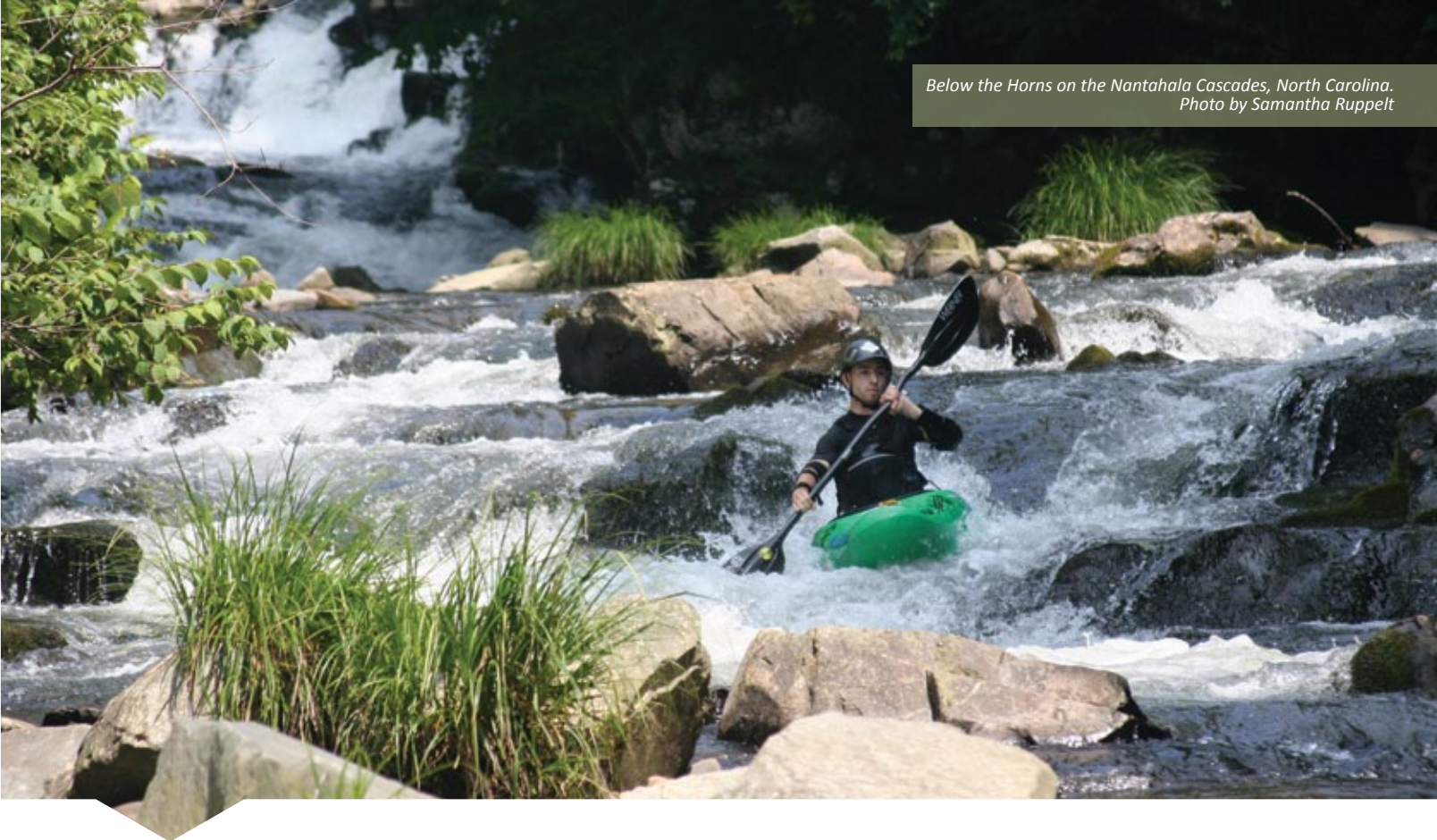
Below the Horns on the Nantahala Cascades, North Carolina.