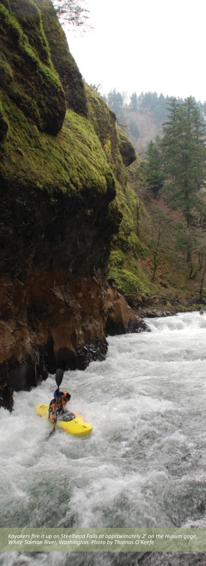
Kayakers fire it up on Steelhead Falls at approximately 2' on the Husum gage, White Salmon River, Washington.