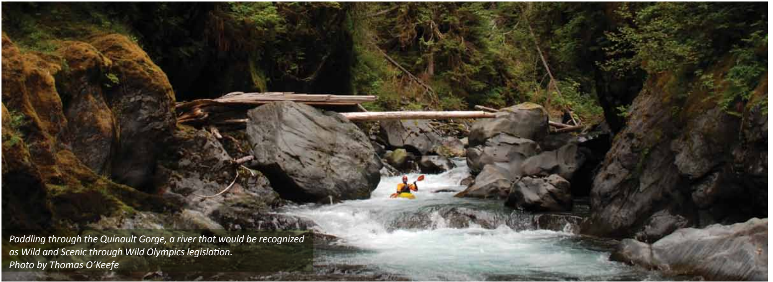
Paddling through the Quinault Gorge, a river that would be recognized as Wild and Scenic through Wild Olympics legislation.