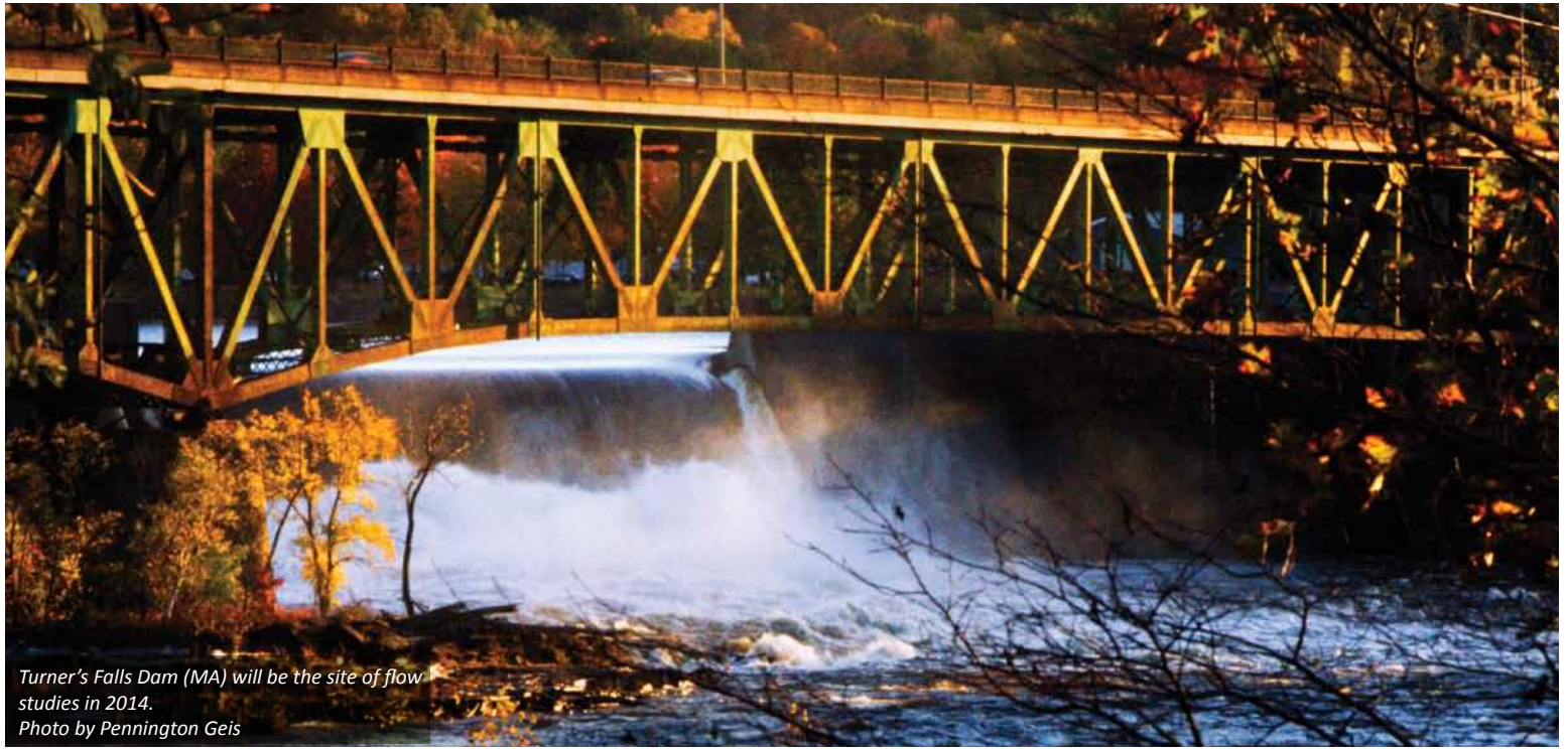
Turner's Falls Dam (MA) will be the site of flow studies in 2014.