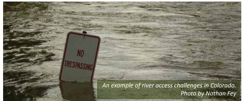
An example of river access challenges in Colorado.

SOUTHERN ROCKIES, COLORADO RIVER BASIN STUDY | American Whitewater is playing a major role in helping the U.S. Bureau of Reclamation understand how recreational boating flows across the Southwest will be impacted by the challenges of prolonged drought, water supply development, and future adjustments to dam operations. We are asking paddlers to help us define optimal flows on rivers in Arizona, New Mexico, and Utah, and will ensure that paddlers have a voice in protecting those flows.