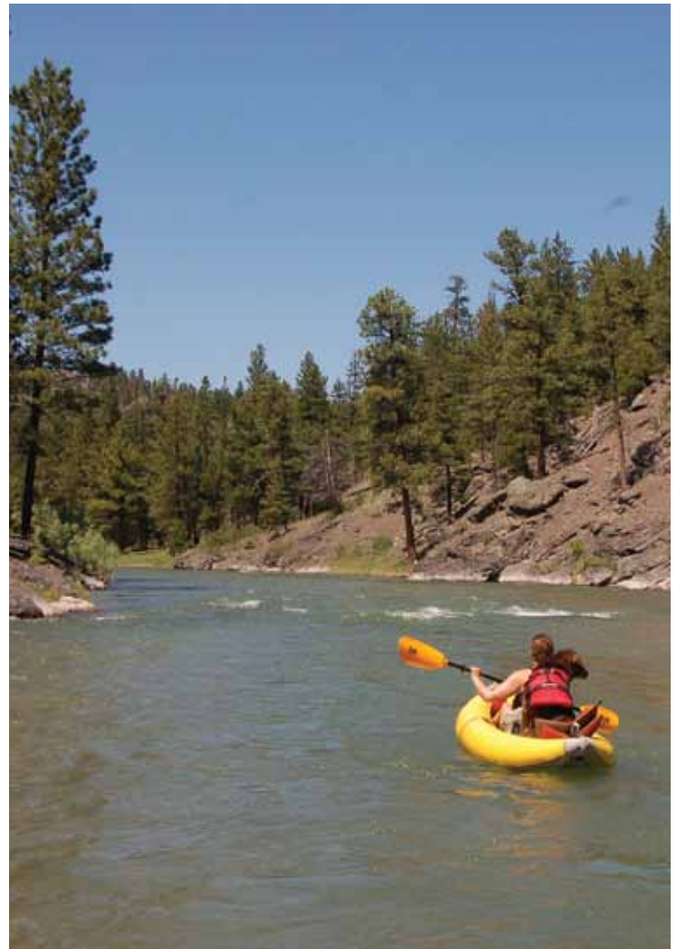
Photo of Cassidy and Alta Randall on Montana's Dearborn River

Many rivers in the Northern Rockies are under-protected and at risk of hydropower development and other impacts. Paddlers are documenting these river's values and advocating for protection with AW's leadership.