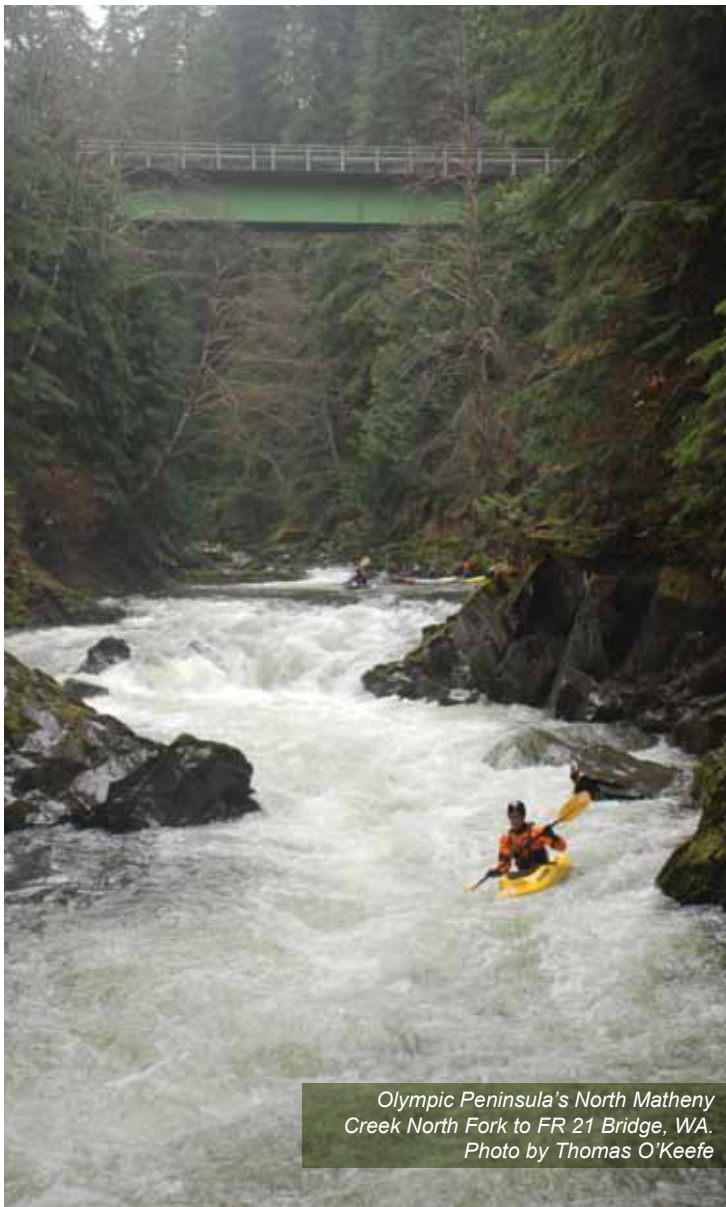
Olympic Peninsula's North Matheny Creek North Fork to FR 21 Bridge, WA.